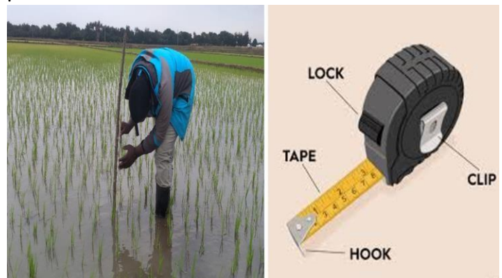
Fig 3. Measuring device and ponding method

irrigation and measurement frequencies were ascertained. The data analysis approach of descriptive statistics and frequencies has been used by many researchers (Yat-sen et al., 2018; Talpur et al., 2013; Han et al., 2022; Simeon et al., 2025; Balan & Saparudin 2023) to draw inferences in their studies. The data analysis was done based on the water depth measurements collected from blocks MS (4-2) and MS (7-1), respectively, each block having 55 rice paddy fields.